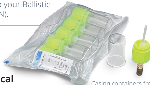
Casing containers from LOCI FORENSICS B.V.

IBIS ClearCase represents the future of automated cartridge case triaging, designed to meet the critical demands of modern law enforcement with unmatched efficiency and reliability.